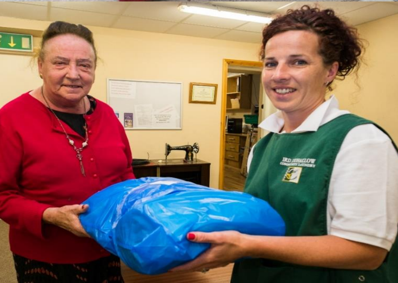
Duhallow Community Laundry