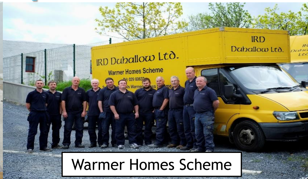
Warmer Homes Scheme