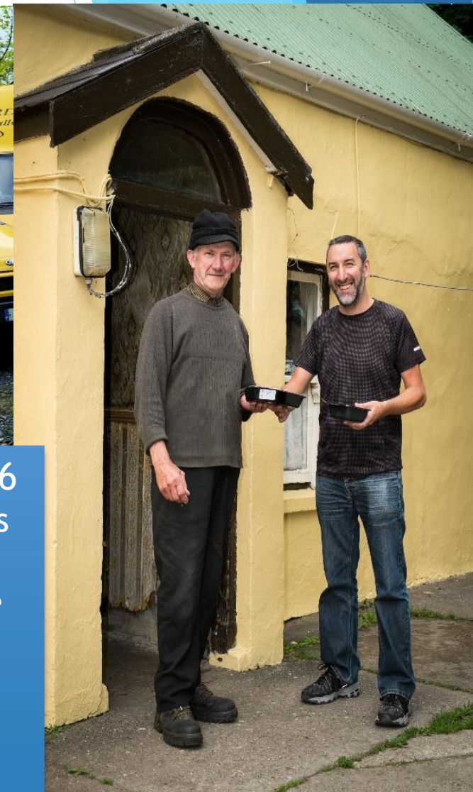
Duhallow Community Food Services