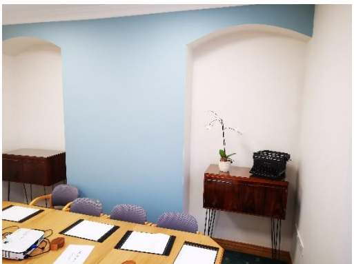
Figure 4: High quality upcycled rosewood cabinets in board room

Due to factors outlined above and the diverse nature of suppliers, the cost of design, collecting, cleaning, repairing and assembling goods was greater than the overall cost of the goods themselves. Overall the project came in on budget even including some items that were specified to a higher standard than originally anticipated e.g. restored wingback chairs for the lobby area, upcycled rosewood cabinets for the board room. However, this does not include the full-time cost of the NWCPO or CRNI in liaising on and coordinating the project, which was absorbed due to the national importance and pilot nature of the project.