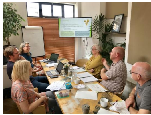
Figure 1: Project consortium kick off meeting

As noted above, the small scale of the second hand sector is a key challenge for projects of this nature. In order to provide the 97 items of furniture making up this project, CRNI identified and worked with more than ten different suppliers. The main suppliers were CRNI members the Rediscovery Centre and Back2New, but goods were also sourced from Recycle IT, Free Trade Ireland, furniture clearances at UCD and Henkel; Second hand Office furniture suppliers Griffin Office Solutions and Aline Office Furniture Ltd; and Adverts (private sale). Coordinating the sourcing and delivery of this project was a joint effort between CRNI, the Rediscovery Centre and NWCPO.