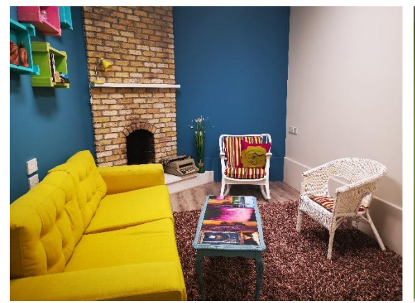
Figure 5: Upcycled chill out room

The carbon savings from this project due to sourcing pre-loved and upcycled furniture over new were approximately 2.6 tonnes CO2 , the equivalent of planting 180 evergreen trees. By working with social enterprises like the Rediscovery Centre and Back2New the project also supported access to jobs and skills for people distant from the labour market.