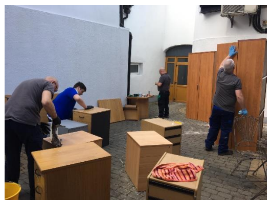
Figure 3: Cleaning and assembling furniture in NWCPO yard

Due to the unfinished nature of the goods delivered for cleaning onsite, there were some negative reactions from staff to the quality of goods delivered. Once cleaned, assembled, repaired and installed any concerns were overcome. However, it was noted that staff buy-in and input should be sought for projects of this nature to understand and manage expectations and identify any key issues.