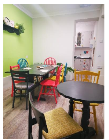
Figure 8: Upcycled canteen