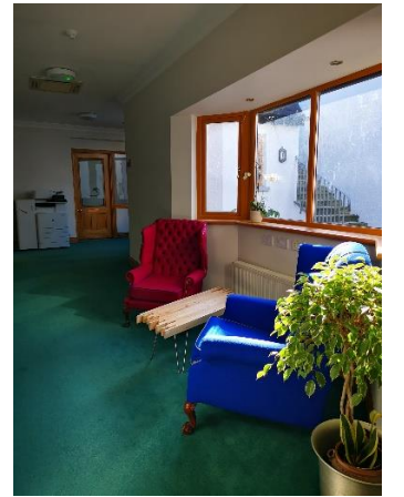
Figure 7: Upcycled lobby furniture