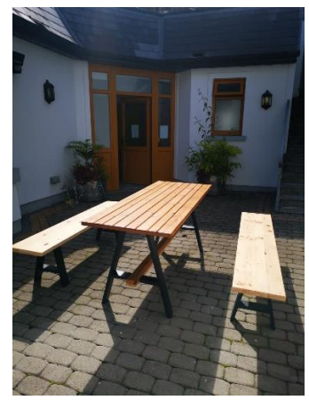
Figure 9: Upcycled outdoor seating and washing machine drum planters

As noted above, this case study will be of great importance in promoting Ireland's circular agenda by demonstrating the feasibility of upcycling at this scale and helping overcome negative attitudes toward and lack of awareness about the quality and availability of second and goods.