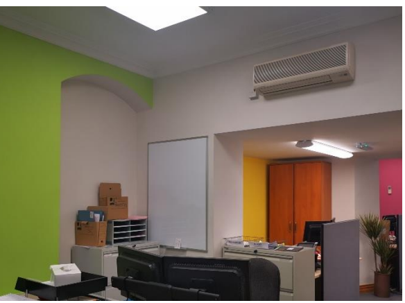
Figure 6: Office space with second hand furniture and recycled paint